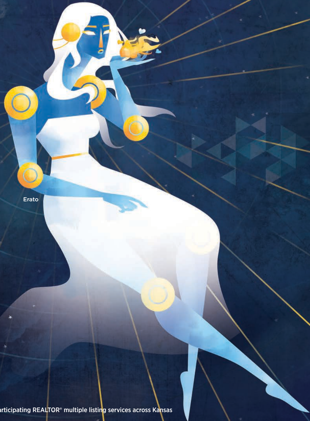
HOME SALES ACTIVITY

THE MANHATTAN/FORT RILEY AREA HOUSING MARKET HAS REMAINED ONE OF THE STRONGEST IN THE STATE.